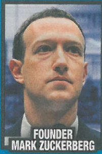
FOUNDER MARK ZUCKERBERG